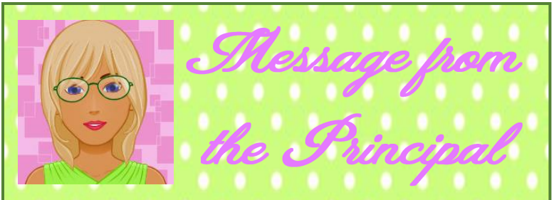
Dear St. Anthony Families,

Our Mission - St. Anthony Catholic School is committed to educating the whole child, by providing a learning environment that promotes academic excellence, spiritual growth, and moral development - building a solid foundation for today's youth to succeed in tomorrow's world.