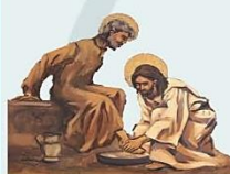
El Lavatorio by: Lirios Doménech

Through Baptism into your Church you have called us to be faithful disciples of your Son and servants of the Kingdom.