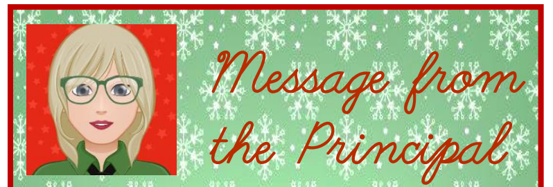
Dear St. Anthony Families,

Our Mission - St. Anthony Catholic School is committed to educating the whole child, by providing a learning environment that promotes academic excellence, spiritual growth, and moral development - building a solid foundation for today's youth to succeed in tomorrow's world.