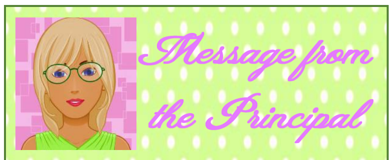
Dear St. Anthony Families,

Our Mission - St. Anthony Catholic School is committed to educating the whole child, by providing a learning environment that promotes academic excellence, spiritual growth, and moral development - building a solid foundation for today's youth to succeed in tomorrow's world.